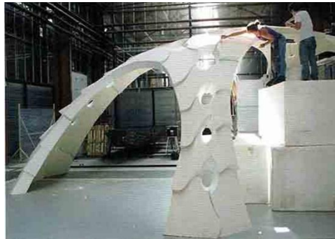
Figure 3: RDM Vault [1]

structures. This is where the components are nested completely within a volumetric block of material. Although this technique is limited to ruled geometries, the entire exterior of the component is shaped, and thus the aggregation can more accurately approximate a freeform surface. In this case the use of a robotic arm “ typically costs less than half the price of a typically capable dedicated CNC machine. ” [1]