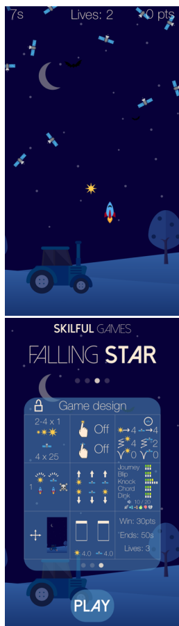
Figure 1: Wevva . The game (top) is modifiable in the design overview panel (bottom). Modifiable parameters include scoring, win/loss conditions, character icons, music, spawning, physics forces, collision responses, etc.